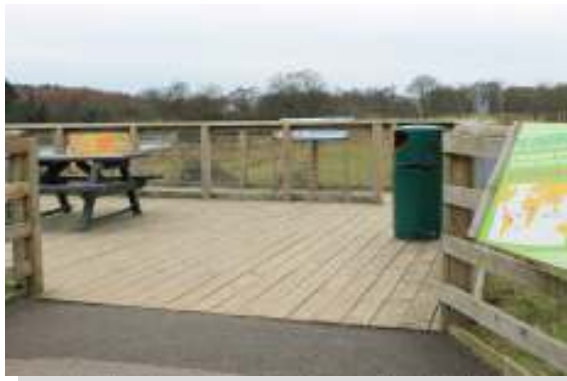
View of Equatorial Viewing Platform