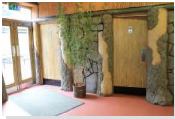
Internal view of Oasis Restaurant toilets

Located within the Oasis Restaurant are two general access toilets with 80cm push doors without handles.