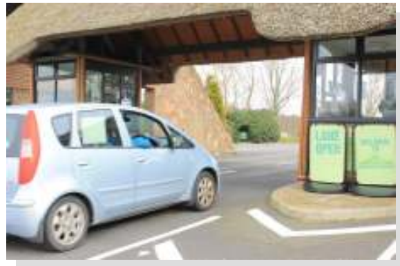
View of entrance kiosks