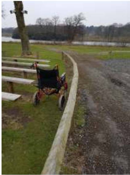
Example of area for wheelchair placement