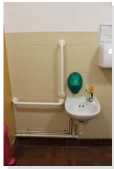
Internal view of disabled toilet

General toilets are situated opposite via paving stones, both entrances are by a 74cm wide doorway. The gentleman's toilets has a small 8cm step into the building.