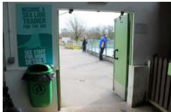
Internal view of access to Sea Lion auditorium