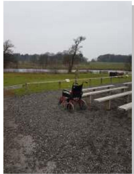
Example of area for wheelchair placement

Under development and due to the flight paths and arrangement of our Bird of Prey displays , wheelchair accessibility may require assistance on uneven ground.