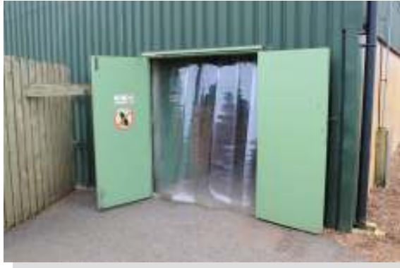
Giraffe House entrance from Equatorial trail

Our Giraffe House entrance through-fare is by two double doors 170cm wide with heat protection flaps which may require some assistance to navigate.