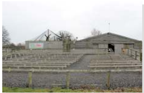
View of outdoor seating from front