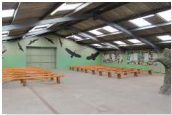
View of seating for indoor displays