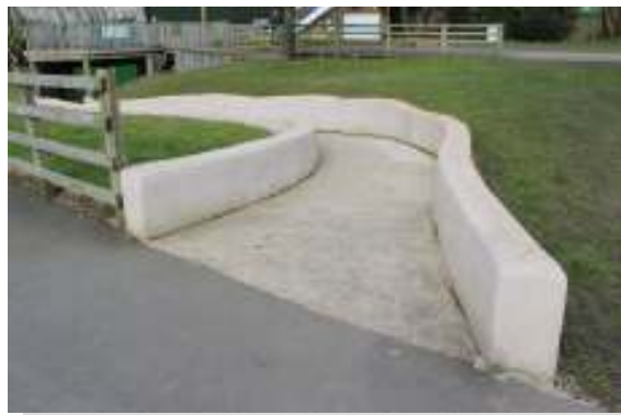
Ramp access to under water viewing window

A viewing platform can be accessed by a wooden decking area with ample space to turn. While we provide steps with a handrail our underwater viewing window is accessible via a shallow ramp at it's narrowest point 140cm wide.