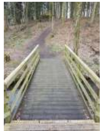
Wild Trail – steps and bridge

Half way around our Wild Trail (allowing for great views of our European Moose) you will come to a series of shall steps or bridges.