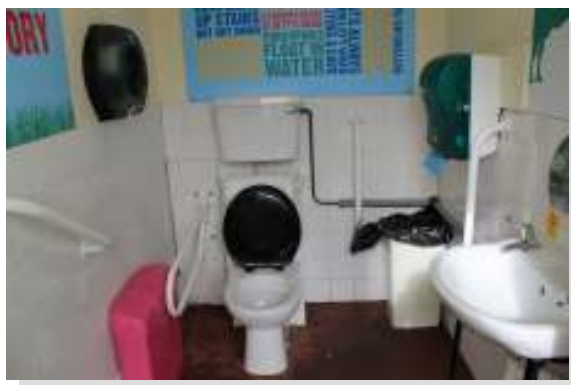
Internal view of disabled toilets

There is sufficient turning space at the entrance to the facility. There is a horizontal rail on the rear of the door. There are also horizontal and vertical grab rails either side of the WC. The toilet is well lit with a linoleum level flooring. Assistance may be required by some users.