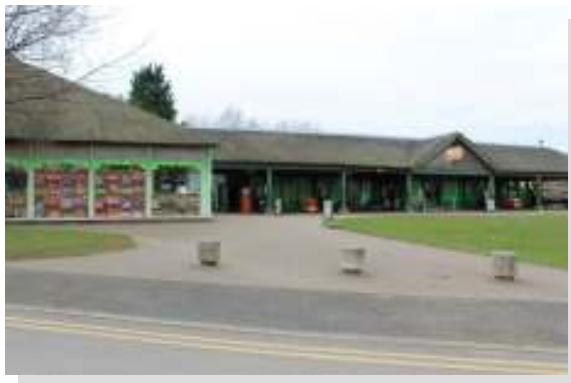
View of shop from main car park

There is sufficient turning space once inside the facility. Lowered counter tops are provided at the tills.