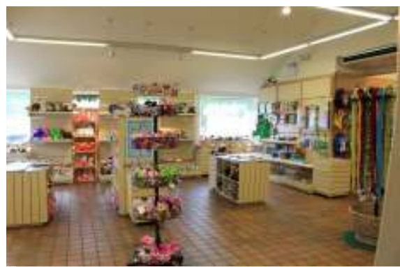
Internal view of Shop