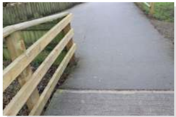
Access to Meerkats via bridge