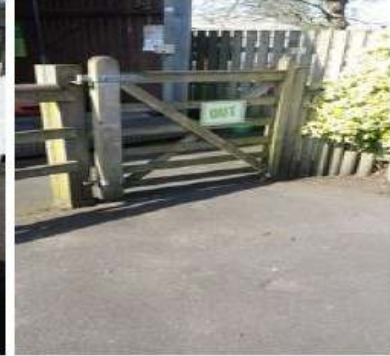
DODGEMS OUT GATE