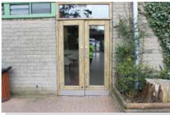
Oasis Restaurant left hand doors by toilet block