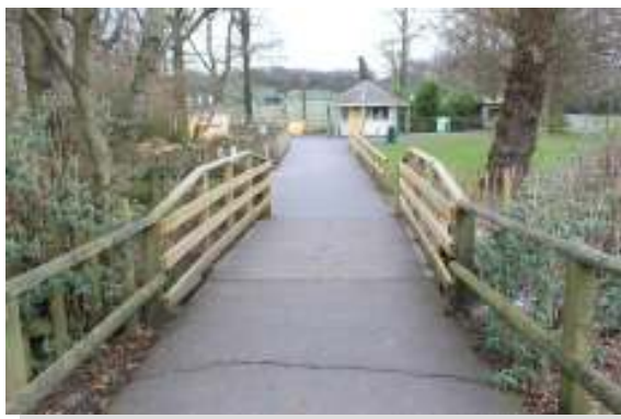
Access to Meerkats via bridge

This bridge may prove difficult for those using mobility scooters