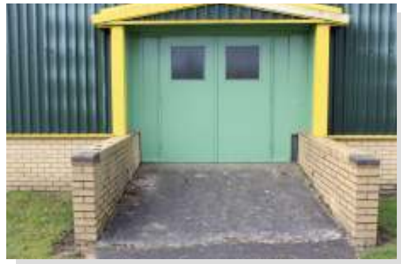
Side fire exit access