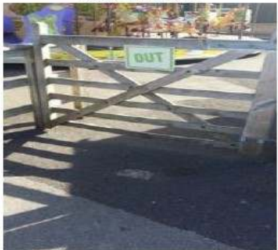
CAROUSEL OUT GATE