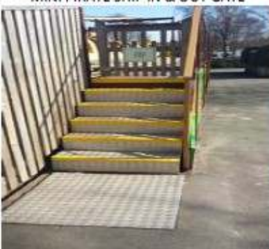
RATTLESNAKE IN GATE