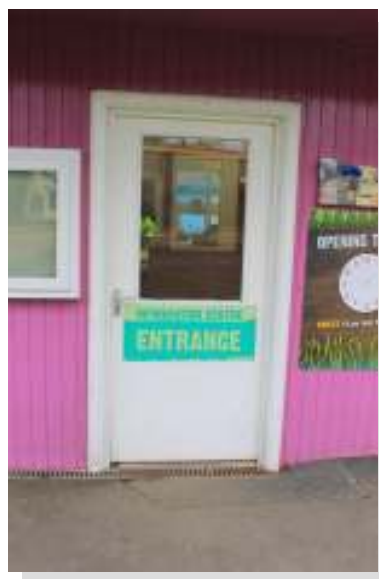
Information Centre front door

Access to our Information Centre is via a ground level doorway 80cm wide. There is sufficient turning space once inside the facility. A lowered 90cm counter can be found inside.