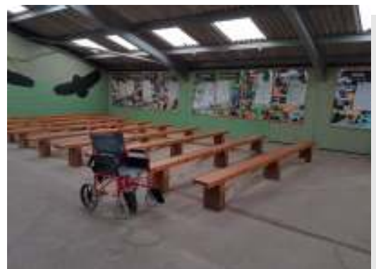
Example of area for wheelchair placement

We will advise guests where to sit safely in the bird of prey arena depending if the show is inside or outside. It is our staffs discretion on placement when shows are in progress.