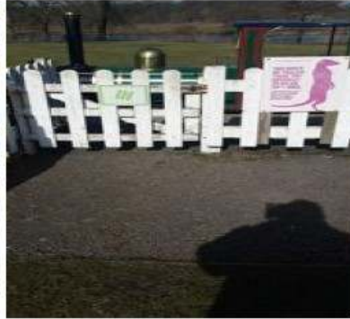
TRAIN IN GATE