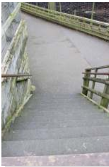
13 steps access to Giraffe Viewing Platform