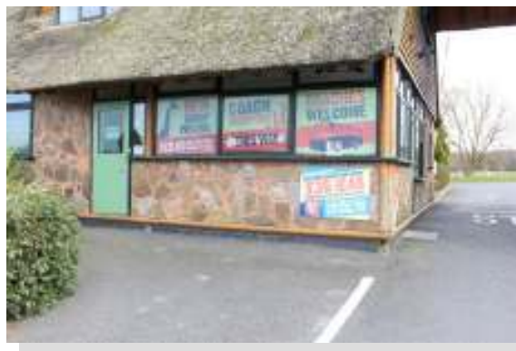
View of Coach Reception

Coach Reception front door is 80cm wide and accessible by a 25cm step.