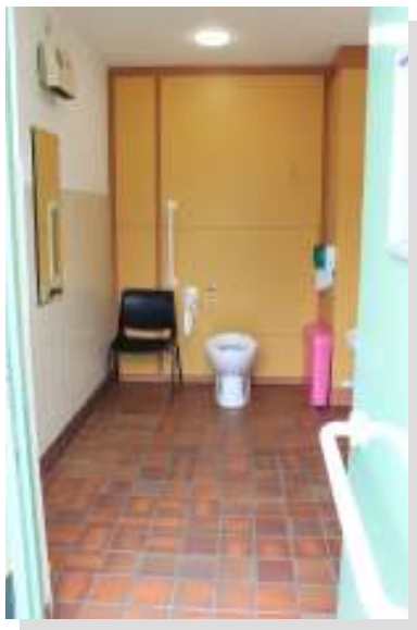
Internal view of disabled toilet

There are also horizontal and vertical grab rails either side of the WC. The toilet is well lit with a linoleum level flooring. Assistance may be required by some users.