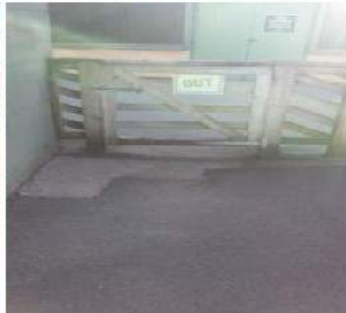
STARDANCER OUT GATE