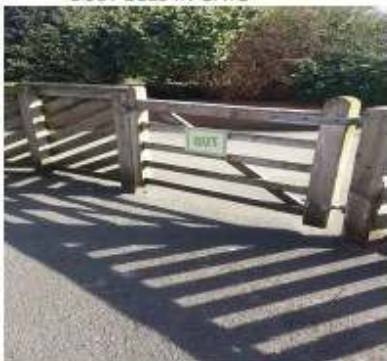
SWINGS OUT GATE