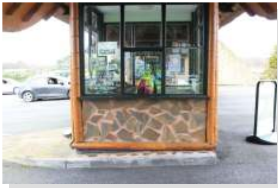
Window height 100cm

Pedestrian entrance (whilst unadvised) is safest on the left hand side leading to Coach Reception.