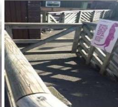
STARDANCER IN GATE