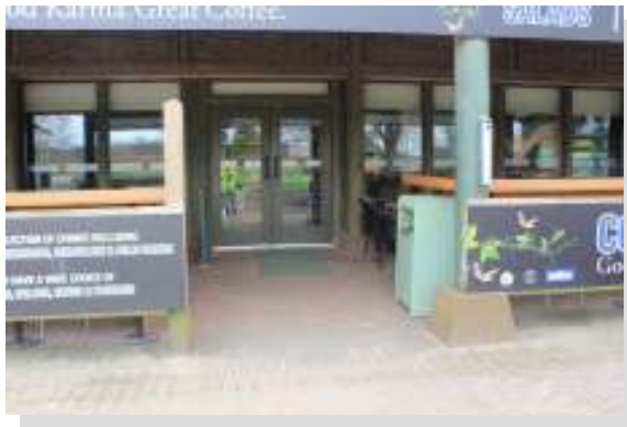
Coffee House doors