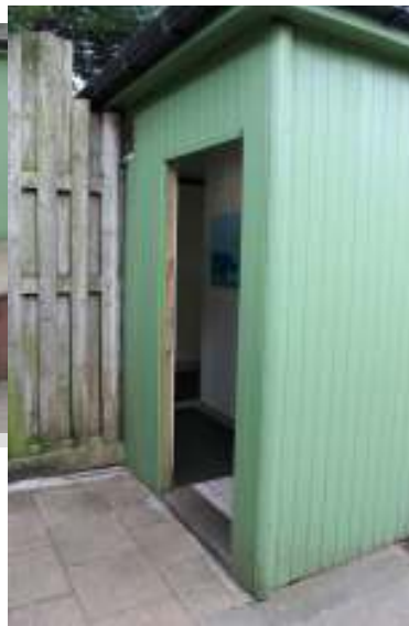
Access to gentlemens toilets 8cm step