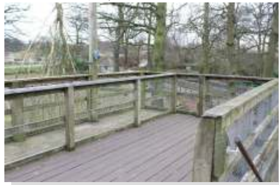
View of Giraffe Viewing Platform