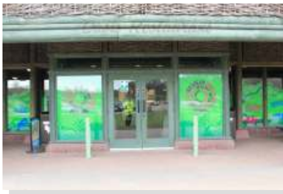
Oasis Restaurant Front entrance doors

Attached to the right of our Oasis Restaurant is the Coffee Shop open during peak times accessed by 170cm wide doors pulling outwards.