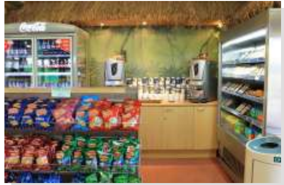
Internal view of Oasis Restaurant 'Grab and Go'