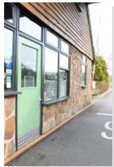
Coach reception side window