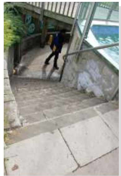
Step access to underwater viewing window