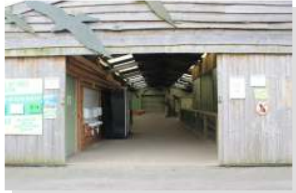
Entrance to indoor aviaries and indoor displays