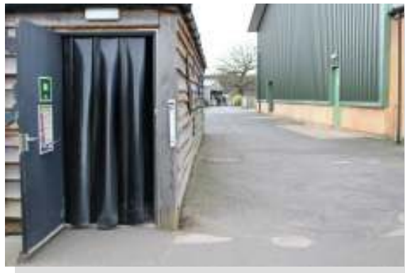
Bat House entrance

Once inside access to the Bat Cave itself is via two 80cm pull doors with minimal visibility. We recommend assistance in navigating this building. Inside the building is a double door system – both doors pull outwards, low visibility and heat retention flaps mean this will be difficult for those unsteady on their feet.