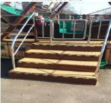
MINI PIRATE SHIP IN & OUT GATE