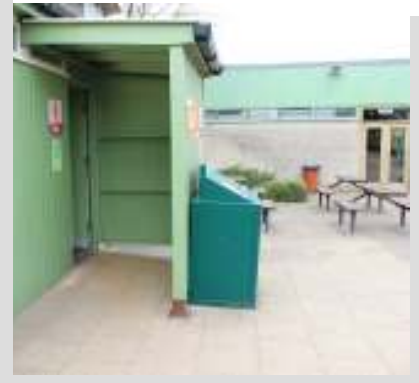
Access to ladies toilets

Top toilets first seen by guests on entering Knowsley Safari.