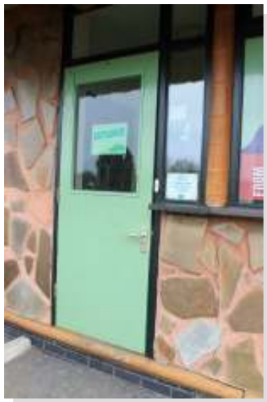
Coach reception front door