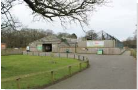
Pathway leading to Bird of Prey

Our indoor aviaries can be accessed by a large slide doorway allowing plenty of movement and turning space once inside.