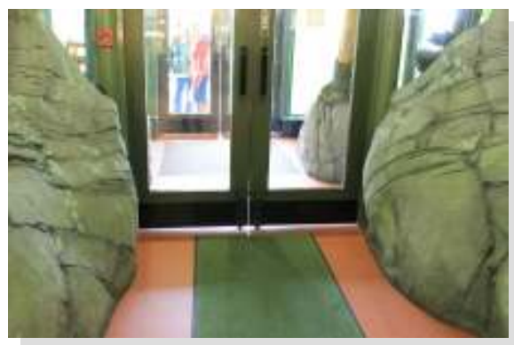
Internal rock decoration