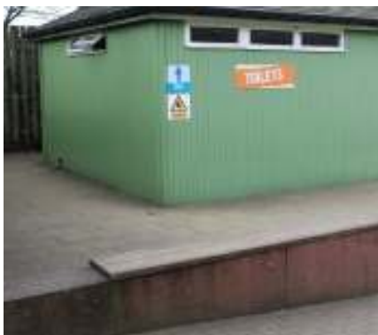
Ramp down to main toilets