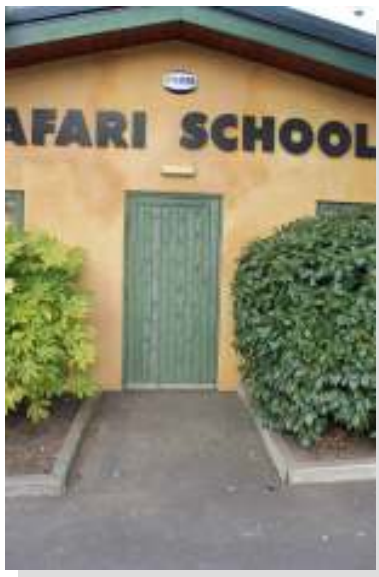
Discover Centre fire exit door

There is sufficient turning space once inside the facility. A fire exit 92cm wide can used if required.