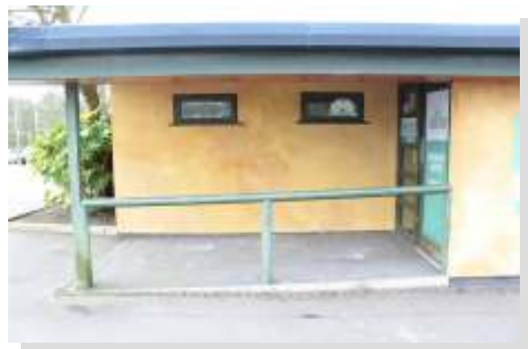
Discover Centre ramp access