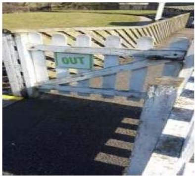
TRAIN OUT GATE