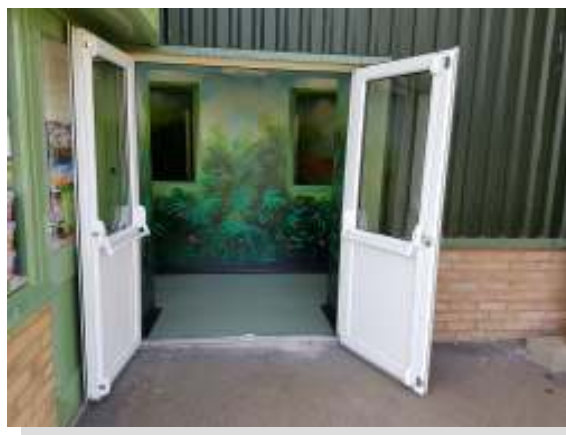
Double door access