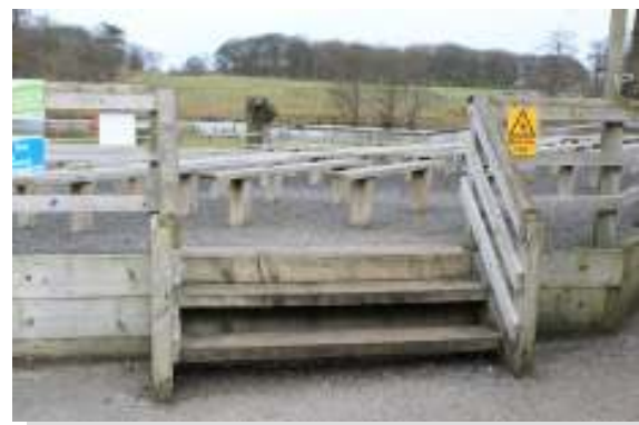
Step access to outdoor seating

We will advise guests where to sit safely in the bird of prey arena depending if the show is inside or outside. It is our staffs discretion on placement when shows are in progress.