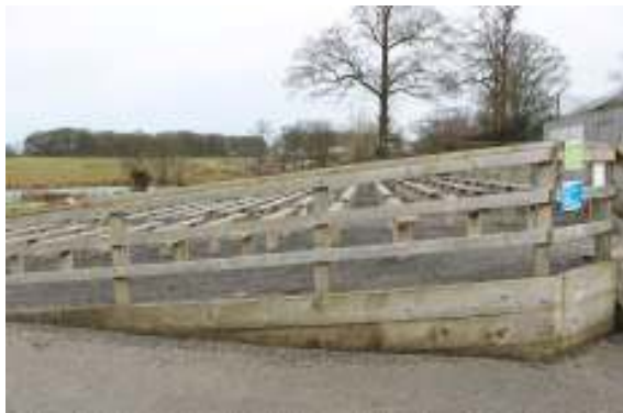
Ramp access over gravel to outdoor seating

Under development and due to the flight paths and arrangement of our Bird of Prey displays , wheelchair accessibility may require assistance on uneven ground.