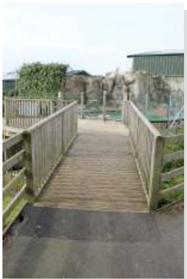
Boardwalk to Sea Lion viewing