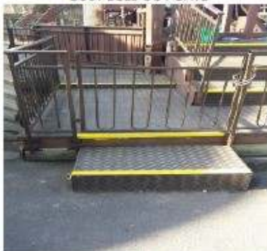
PIRATE SHIP IN & OUT GATE