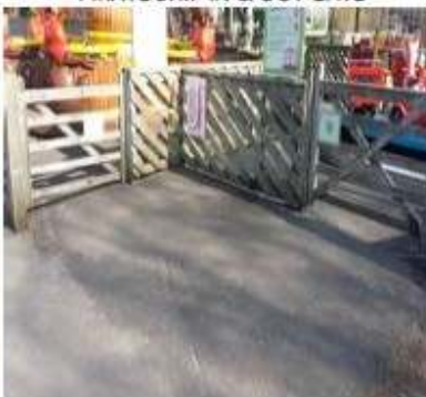
IN & OUT BEARS & ROUNDABOUT