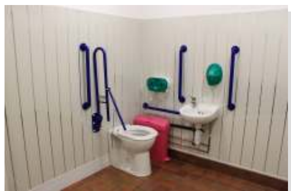
Internal view of larger disabled toilet