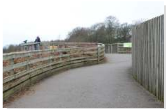
Incline leading to viewing platforms