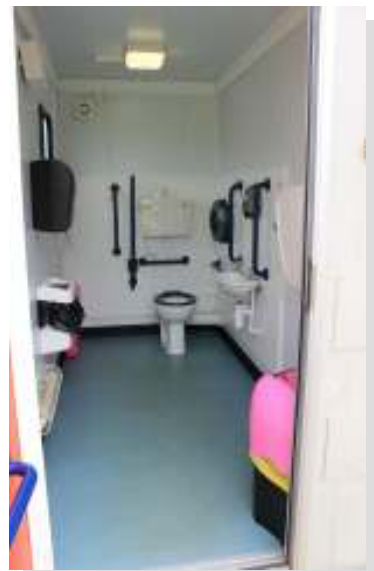
Internal view of disabled toilets