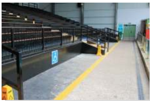
Front access disabled area