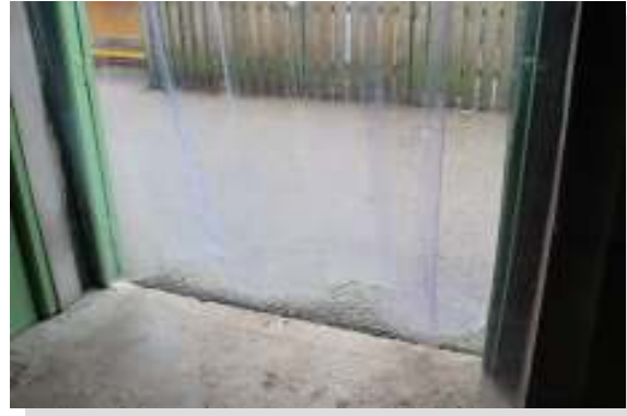
Heat retention flaps