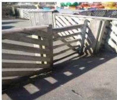
BUSY BEES IN GATE