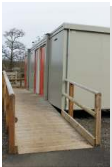
Ramp access to toilets