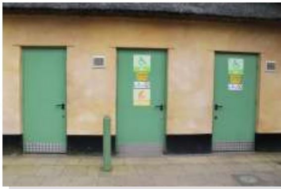
Disabled toilet entrance