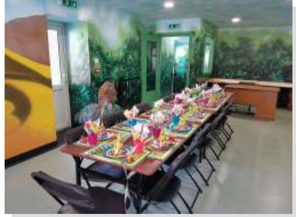
Internal view of 'Habitats' room