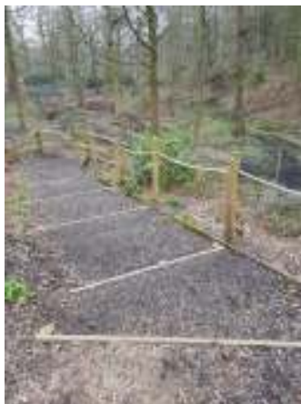
Wild Trail – shallow steps