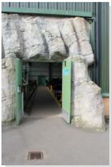
Access to Sea Lion auditorium

Seating is strictly first come first serve – those positioned at the centre of the stage may find they will get wet at the end of the show from the Sea Lion high ball jump. Assistance may be required.