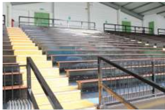
View of grandstand seating from disabled seating area