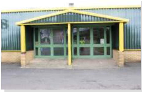
Bee Centre front access

A side fire exit 170cm wide can be opened with push bars, it has a steep ramp leading onto a pavement area so assistance may be required.