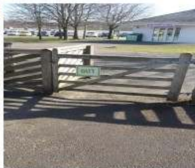
BUSY BEES OUT GATE