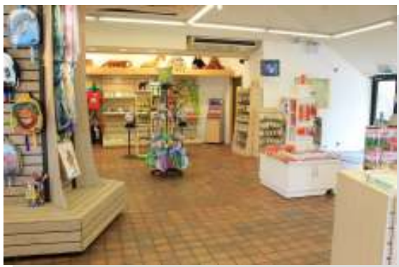
Internal view of Shop