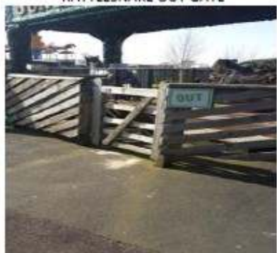
JUNGLE SAFARI OUT GATE