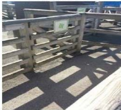
CAROUSEL IN GATE