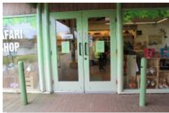
Shop front door entrance