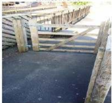
IN QUEING GATE PIRATE SHIP