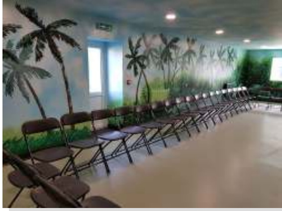
Internal view of 'Rainforest' room

Our exciting new party rooms can house classroom sessions and birthday parties. Access is by ground level doors of which there are two 76cm wide doors or double 150cm doors.