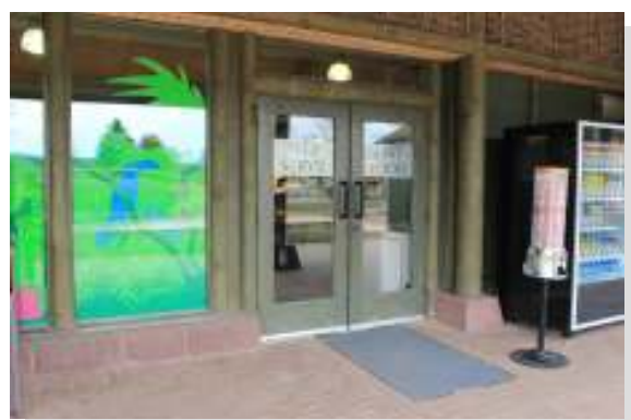
Oasis Restaurant right hand doors by play area