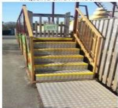
RATTLESNAKE OUT GATE