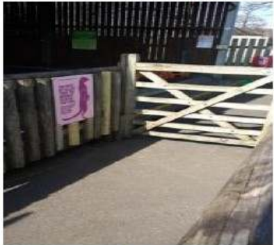
DODGEMS IN GATE