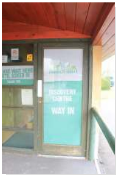
Discover Centre door access