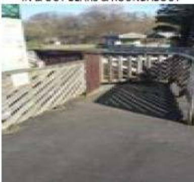
JUNGLE SAFARI IN GATE