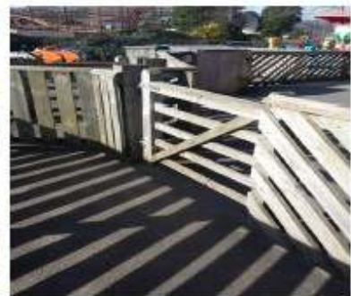
SWINGS IN GATE