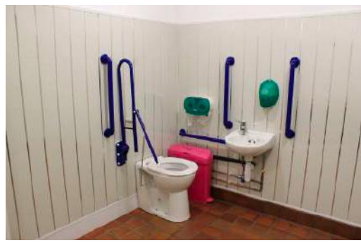
Internal view of larger disabled toilet