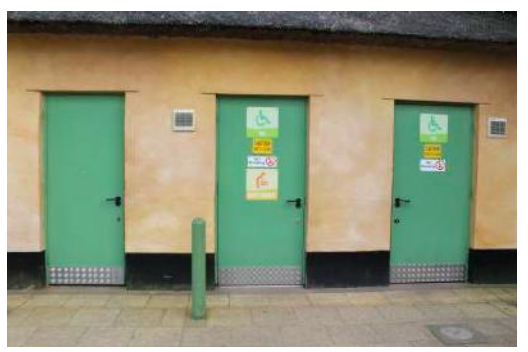
Disabled toilet entrance

We also offer an adult hoist and changing facility. Unfortunately, we don't have braille or tactile signage.