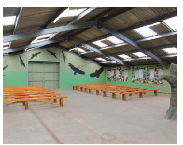
Entrance to indoor aviary