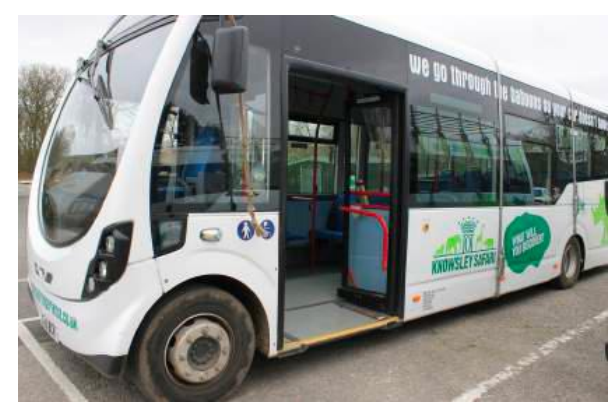
Side view of Baboon Bus

Our Baboon Bus can take between 1 and 2 hours o go around the safari drive, with n current option for toilet breaks for leaving the vehicle.