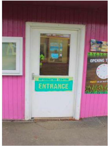
Information centre front door

Access to our information centre is via a ground level doorway 80cm wide. There is sufficient turning space once inside the facility. A lowered 90cm counter can be found inside.