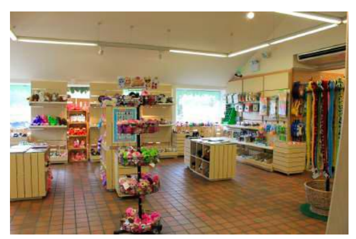
Internal view of shop

Once inside the gift shop, wide isles allow for sufficient turning space for wheelchair users, and the store includes low level counter tops for ease of use.