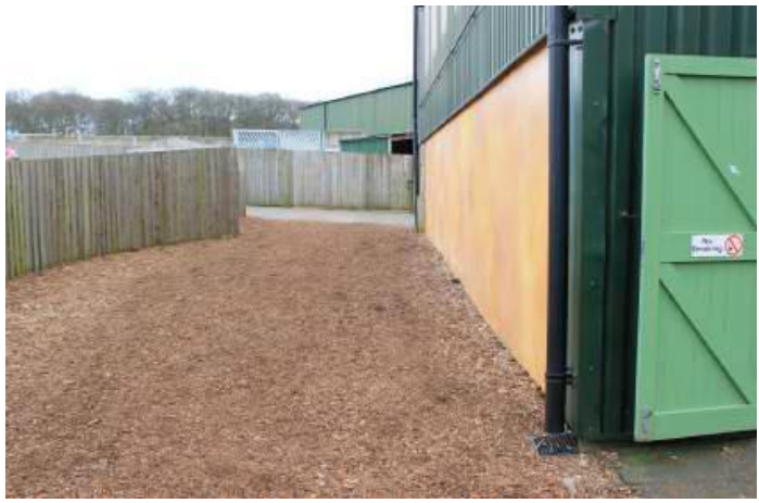
Wood chip pathway to Equatorial Trail

Surrounding our giraffe house leading to our equatorial trail viewing platform is bark chip walk ways which wheelchair users may find difficult to navigate, but in most cases the giraffe house doors will allow easy access.