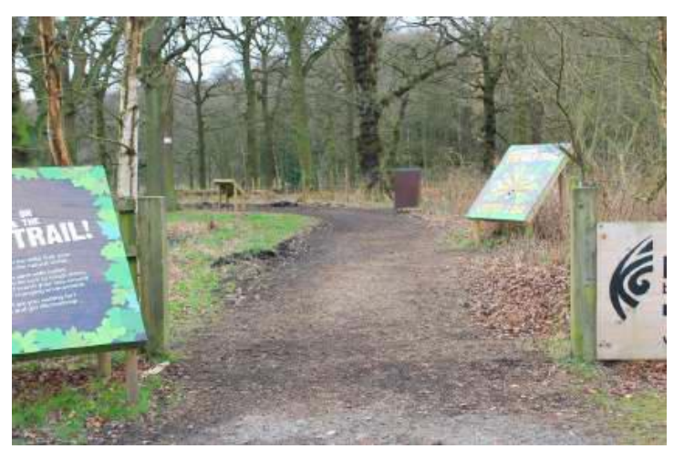
Entrance to Wild Trail

A newer addition to our foot safari is a picturesque wooded area, known as the Wild Trail, teeming with native wildlife and our European Moose.