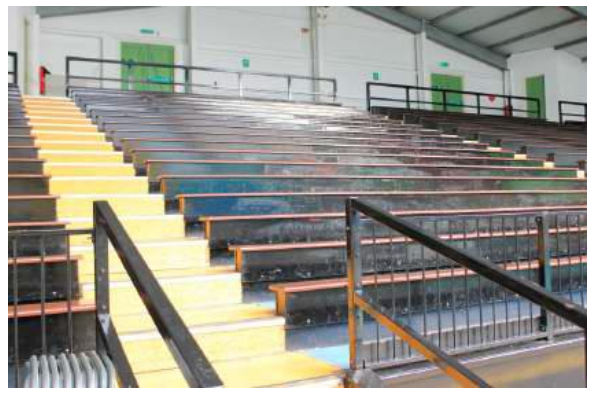
Internal grandstand seating

Seating is strictly first come first serve- those positioned at the centre of the stage maybe find they will get wet at the end of the show from the sea lion high ball jump. Assistance may be required.