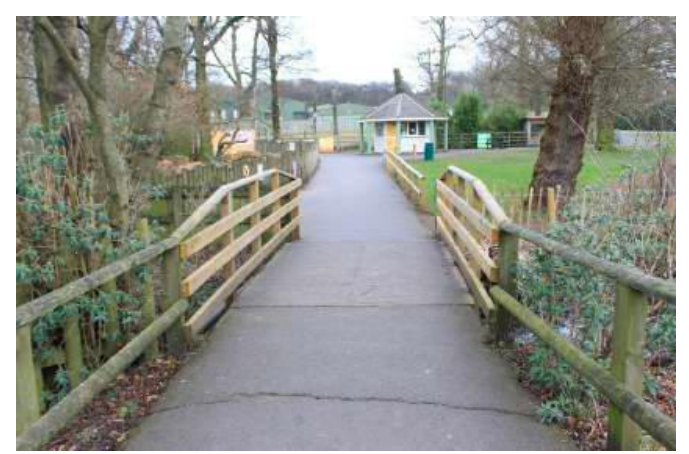
Access to meerkats via bridge

There are green areas around the foot safari, including the main lawns surrounding our Oasis Restaurant, the picnic area opposite our elephant paddock and the planted borders leading up to the safari drive. These areas are also reachable via alternative pathways.