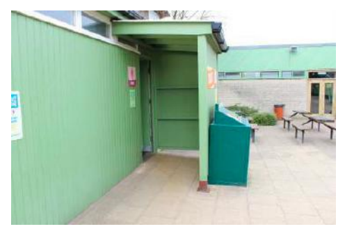
Access to ladies' toilets

General toilers are situated opposite via paving stones, both entrances are by a 74cm wide doorway. The gentleman's toilets have a small 8cm step into the building.