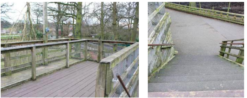
View of giraffe platform

Access through and around our giraffe house is by tarmac pathways firstly leading to our giraffe viewing platform comprising of 13 steps (170cm wide) with handrails on both sides with gripping material.