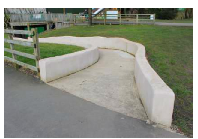
Ramp to underwater viewing window

A viewing platform can be accessed by a wooden decking area with ample space to turn. While we provide steps with a handrail, our underwater viewing window is accessible via a shallow ramp at it's narrowest point, 140cm wide.