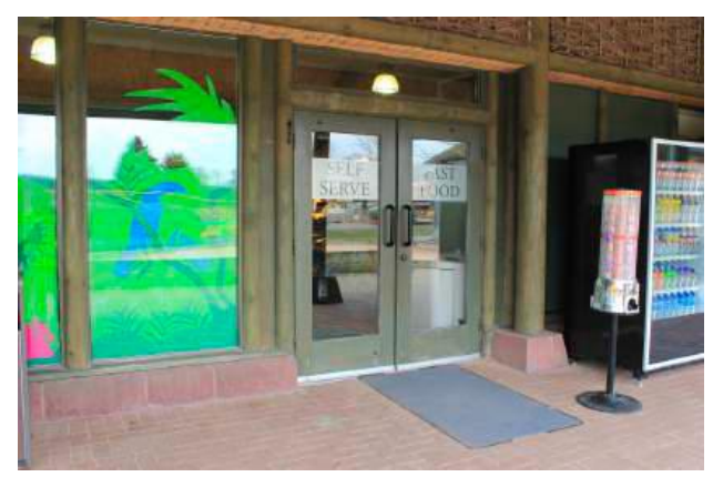
Oasis restaurant right hand doors by play area

Once inside, our décor includes a large rock face on either side of the main doors that as it's narrowest point is 145cm wide. The restaurant has a serving area where the food is purchased and placed on a tray. Members of the catering team will offer to carry trays for those who require assistance.