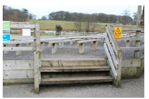
Wheelchair seating on uneven ground Steps to outdoor seating, ramp access available