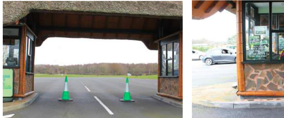
View of entrance kiosks from vehicle