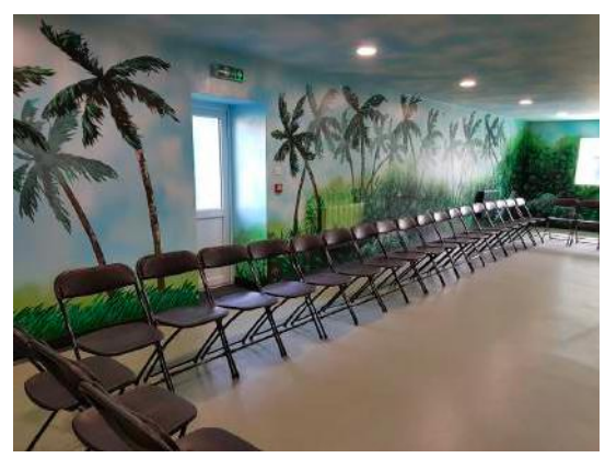
Internal view of Rainforest room

Our exciting new party rooms can house classroom sessions and birthday parties. Access is by ground level doors of which there are two 76cm wide doors or double 150cm doors.