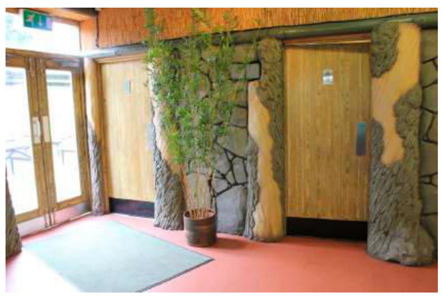
Internal view of Oasis Restaurant toilets

Located within the Oasis Restaurant are two general access toilets with 80cm push doors without handles.