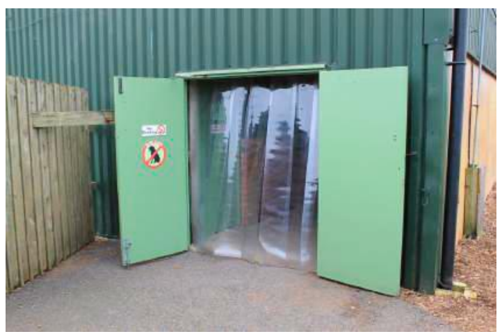
Giraffe house entrance from Equatorial trail

Our giraffe house entrance thorough-fare is by two double doors 170cm wide with heat protection flaps which may require some assistance to navigate.