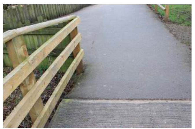
Access to meerkats via bridge

This bridge may prove difficult for those using mobility scooters.