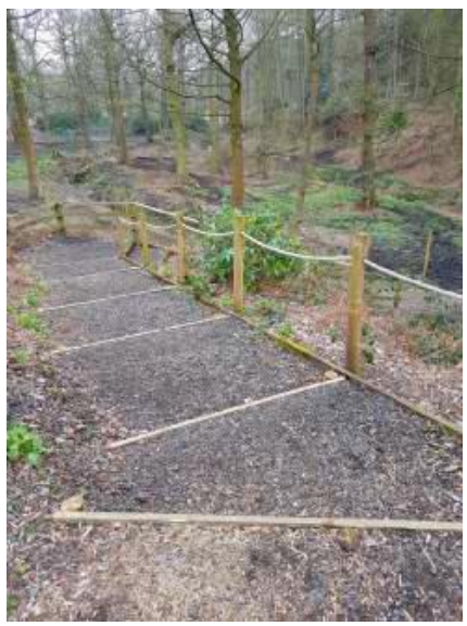
Wild Trail – shallow steps

Half way around our Wild Trail (allowing for great views of our European Moose) you will come to a series of small steps or bridges.