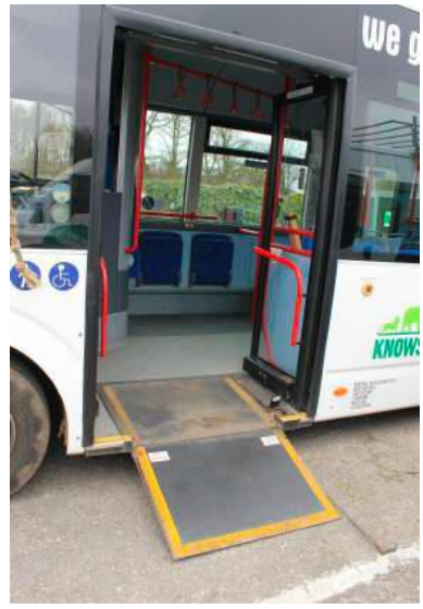
Wheelchair access on bus

Our larger 33-seater Baboon Bus has a retractable wheelchair ramp allowing easy access for one wheelchair user. We ask for 48+ hours notice when wishing to book on our Baboon Bus with wheelchair facilities.