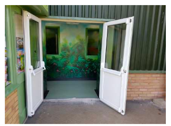
Double door access