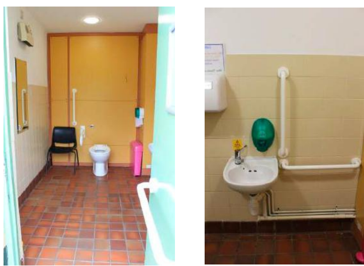
Internal view of disabled toilets

There are also horizontal and vertical grab rails either side of the WC. The toilet is well lit with a linoleum level flooring. Assistance may be required by some users.