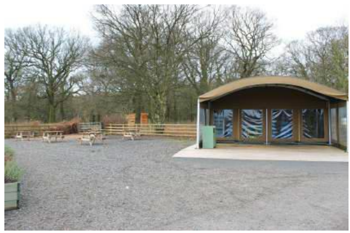
Woodland picnic and café area

Opposite our bird of prey centre are a set of toilets accessible by some hard standing/gravel to a wooden ramp with handrails on both sides. Comprising of two regular and one disabled toilet block. Doors are 80cm wide with a small ground level lip.