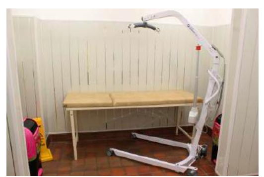
Adult changing facility

Access to the two disabled toilets is by a 92cm wide door with forward transfer to the WC – this may be awkward for some wheelchair users, and may require further assistance. There is sufficient turning space at the entrance to the facility and a horizontal rail on the rear of the door.