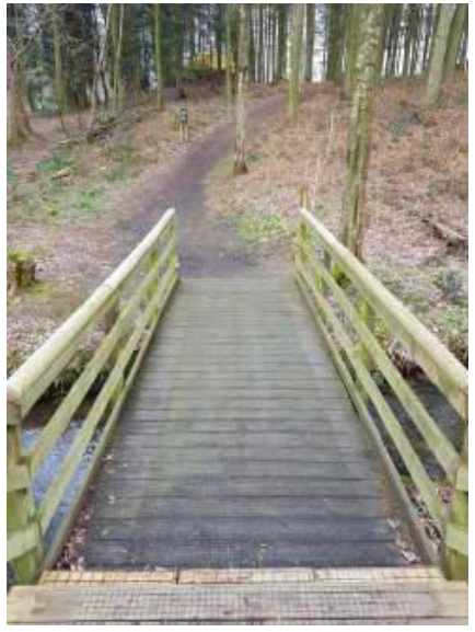
Wild Trail – steps and bridge