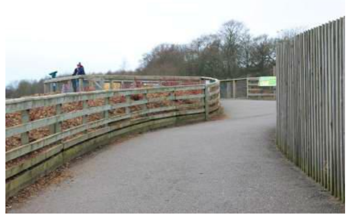
Incline leading to viewing platforms

An incline leads to our viewing platform overlooking our tapir/sitatunga and Mizzy lake, with decking allowing plenty of room for turning around.